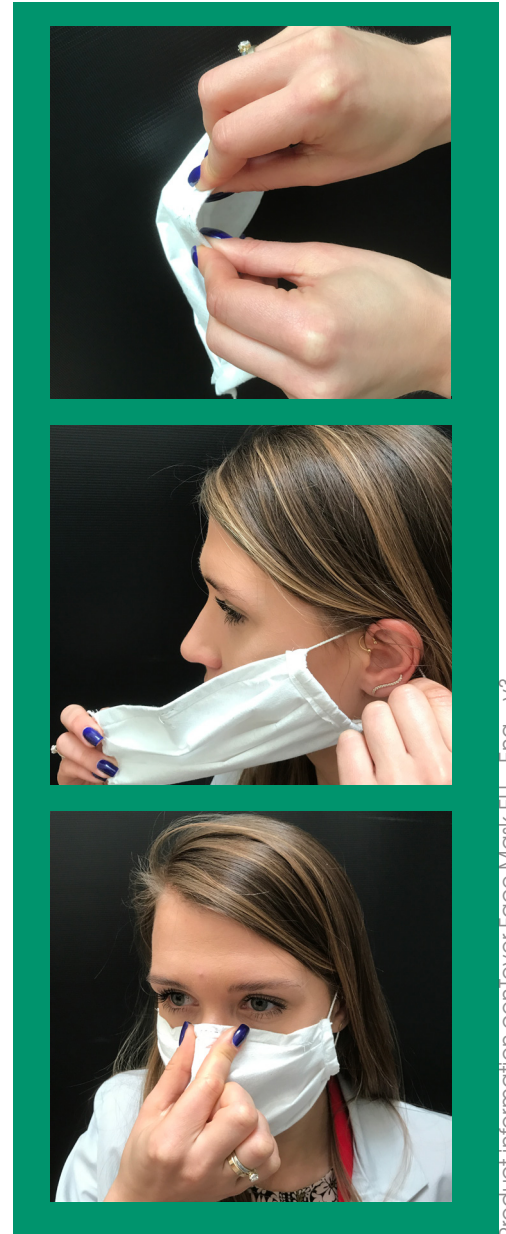
Product information conteyor Face Mask EU – Eng – v3

After the first washes, it is possible to see “pilling” appear on the fabric; this has no effect on the filtration quality of the mask